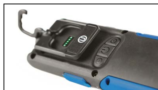
Clip, hook, magnet, charge indicator at the rear