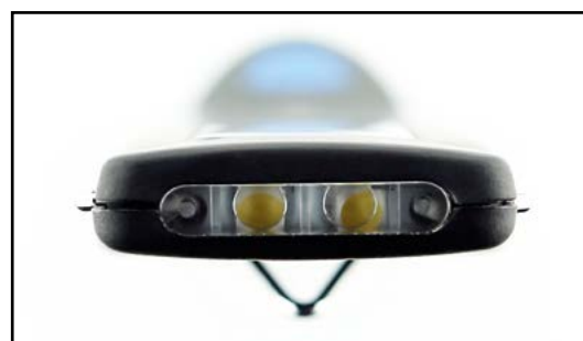
Additional LED light on the top