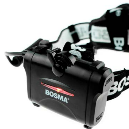
Rear red light