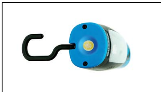
Additional LED light on the top