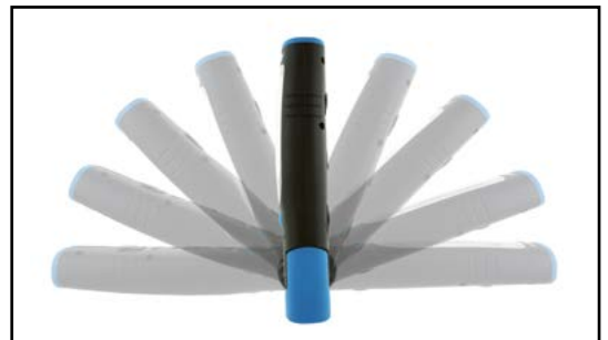
Viewing angle adjustment