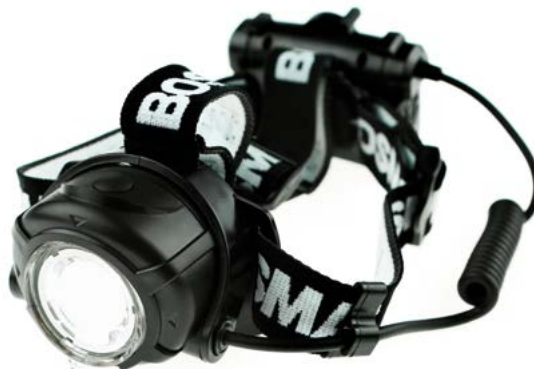
Brightness and light beam adjustment