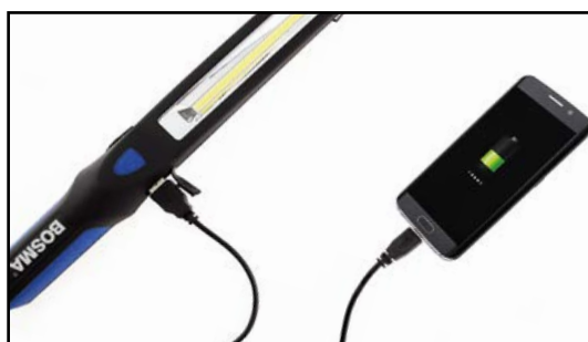
Power bank function