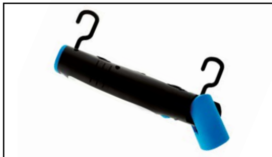
2 pcs 360 degree swivel fold-out hook