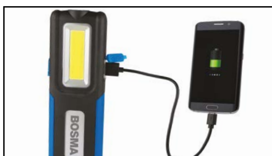
Power bank function