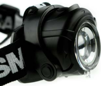
Viewing angle adjustment