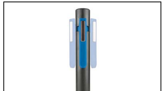
Rotating pen clip with magnet