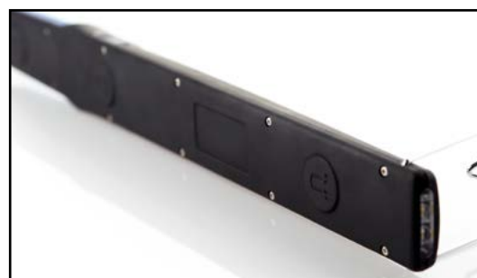
3 magnets at lamp rear