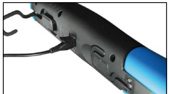
Strong magnet in the base and at the rear