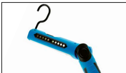
Swivel fold-out hook