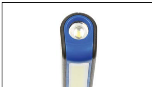
Additional LED light on the top