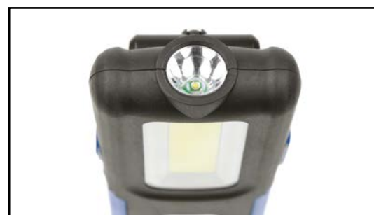
Additional LED light on the top