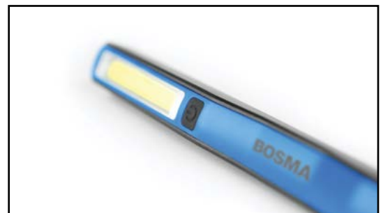
Handy shape and size